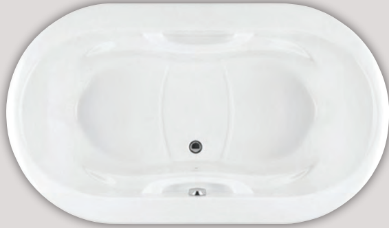
AMMA OVAL 7242