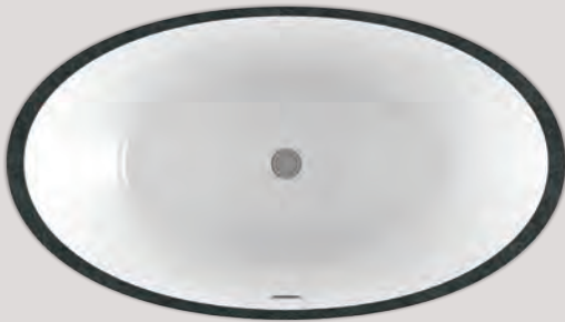
CHARISM OVAL 6436 (FREESTANDING)