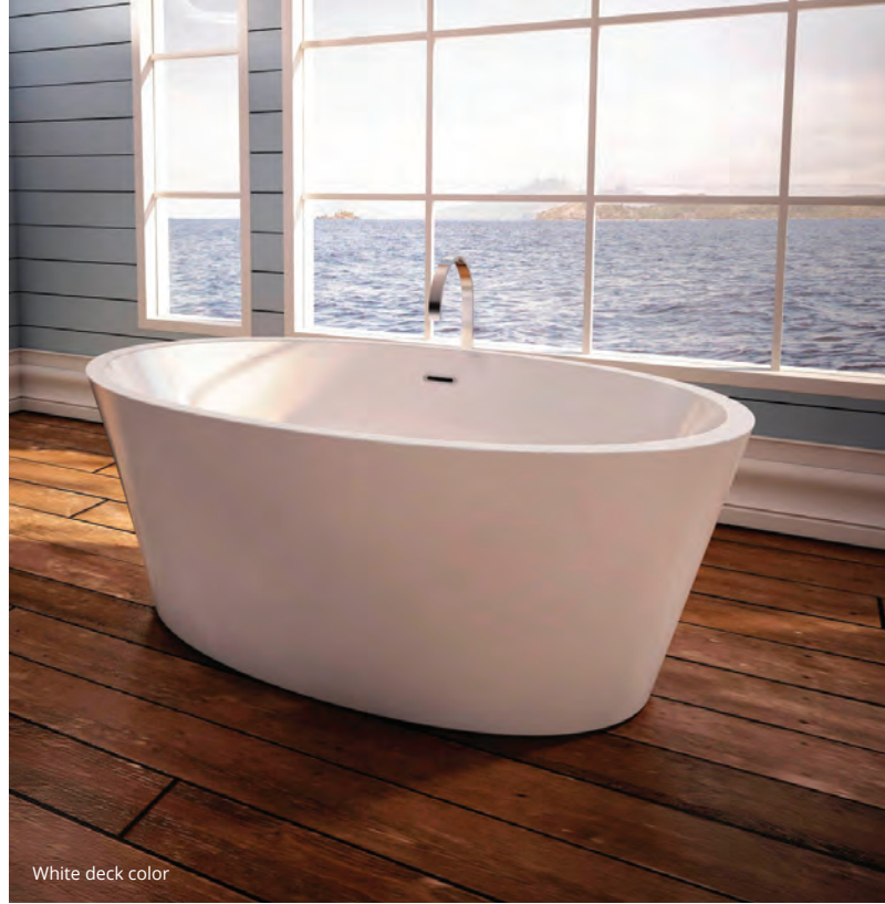
White deck color