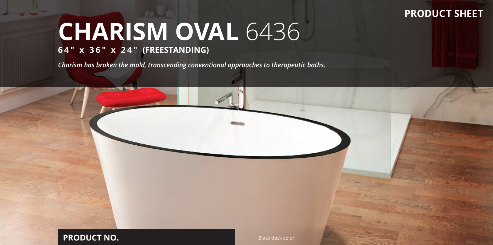
Black deck color

Charism has broken the mold, transcending conventional approaches to therapeutic baths.