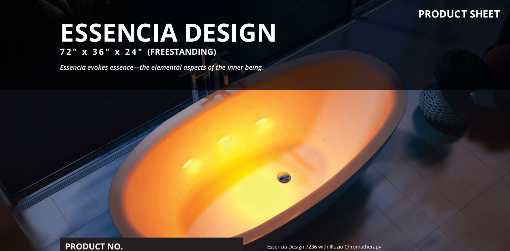
Essencia Design 7236 with Illuzio Chromatherapy

Essencia evokes essence—the elemental aspects of the inner being.