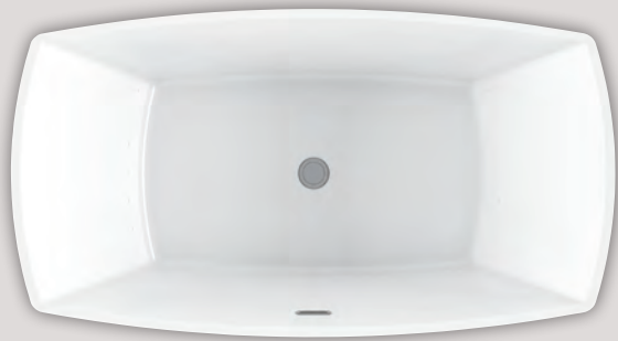
EVANESCENCE 6634 (FREESTANDING)