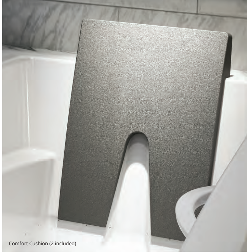
Comfort Cushion (2 included)