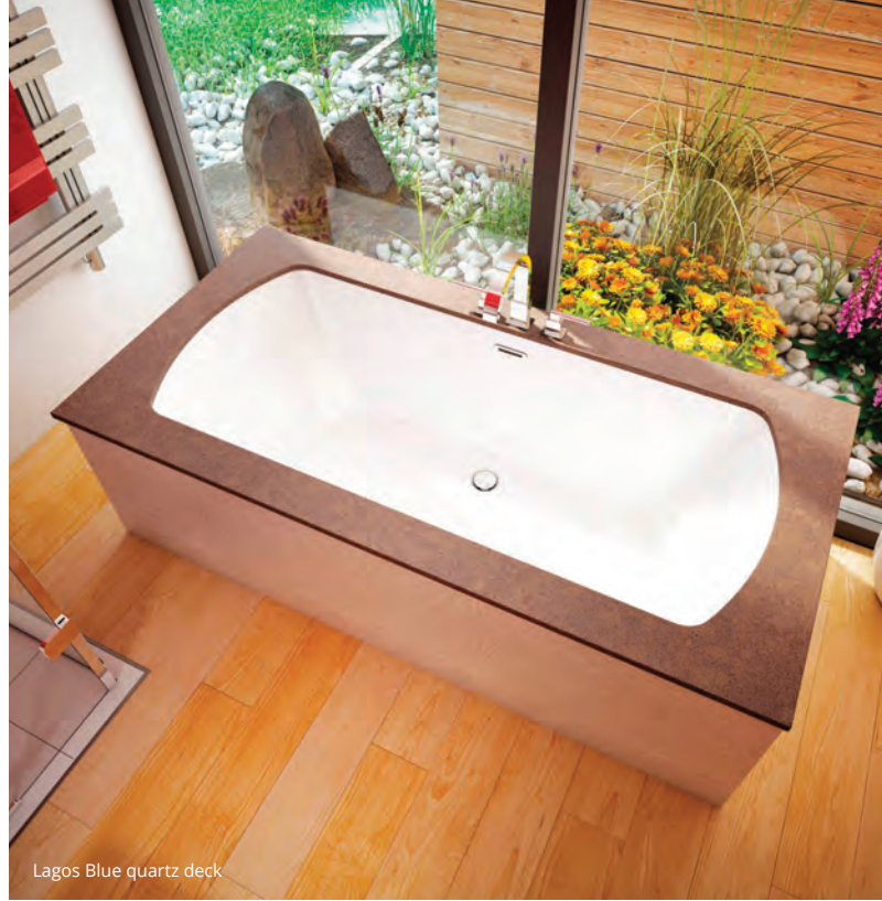
Lagos Blue quartz deck