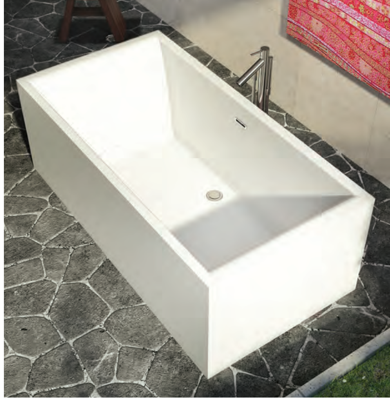
NOKORI 7131 (FREESTANDING)