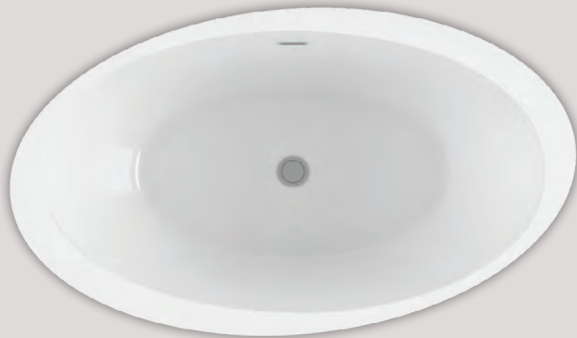
OPALIA 6839 OBLIQUE ELLIPSE - RIGHT (FREESTANDING)