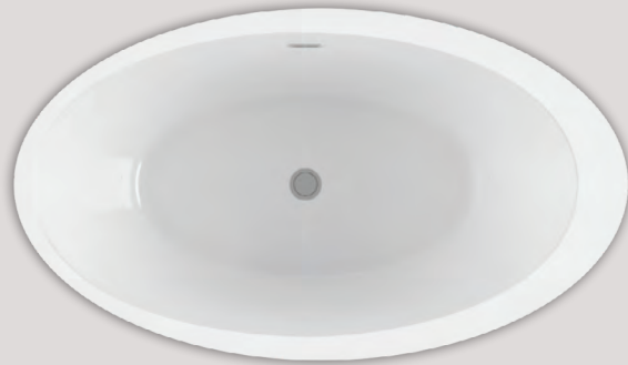
OPALIA 6839 OFF-CENTERED ELLIPSE - LEFT (FREESTANDING)