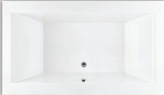
ORIGAMI 7236 ORIGINAL SERIES