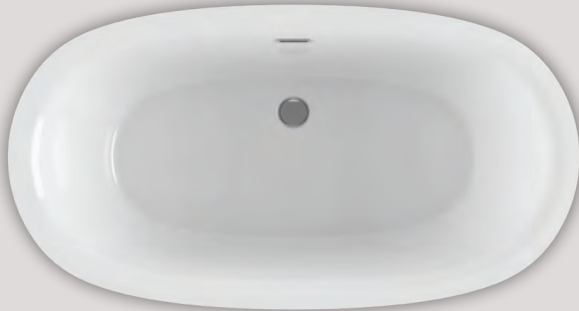
VIBE DESIGN 6033 (FREESTANDING)