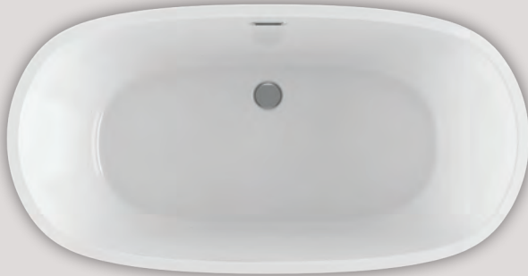
VIBE OVAL 5830 (FREESTANDING)