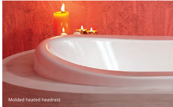
Molded heated headrest