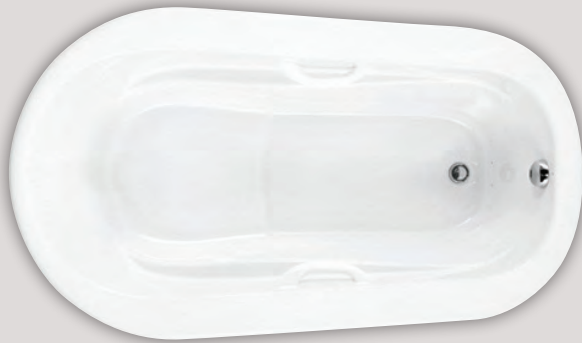
AMMA OVAL 6638