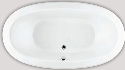
SANOS 6636 (FREESTANDING)