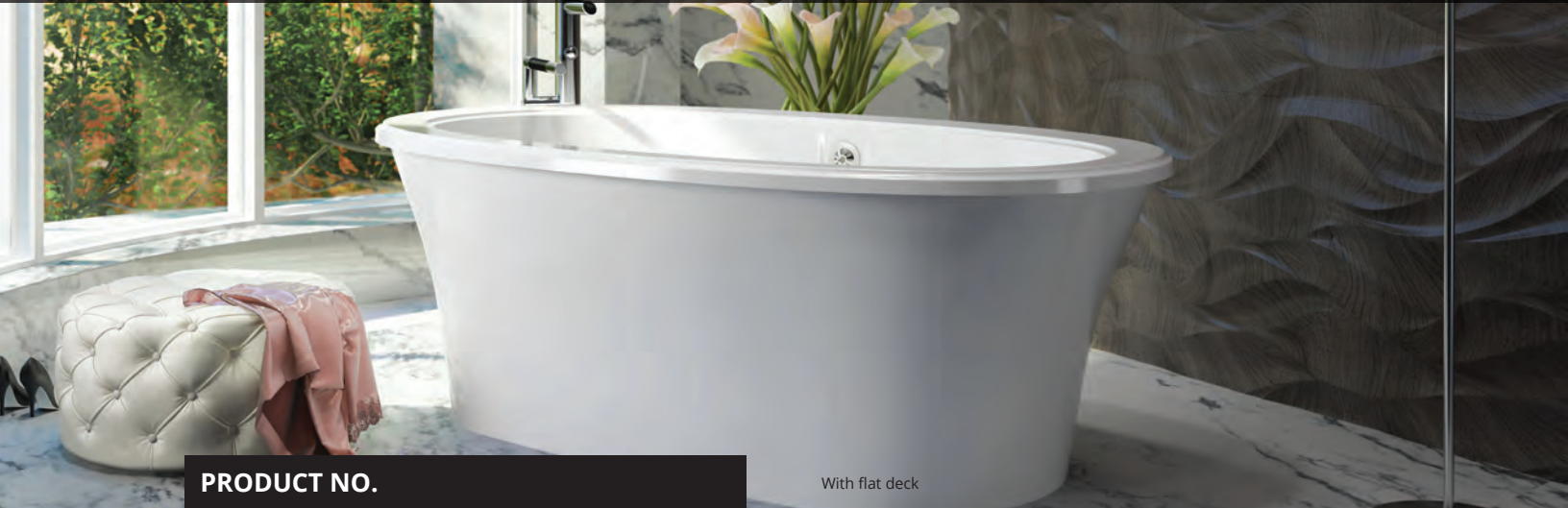
With flat deck

The name Balneo evokes the art of bathing. For BainUltra, a bath is an important ritual, part of a lifestyle that encourages you to slow down and take time for yourself.