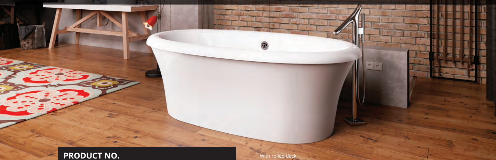
With rolled deck

The name Balneo evokes the art of bathing. For BainUltra, a bath is an important ritual, part of a lifestyle that encourages you to slow down and take time for yourself.