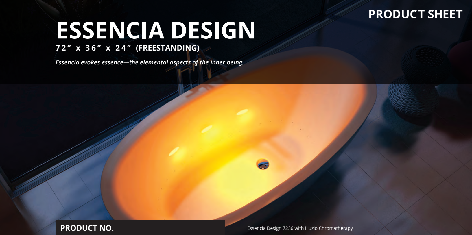
Essencia Design 7236 with Illuzio Chromatherapy

Essencia evokes essence—the elemental aspects of the inner being.