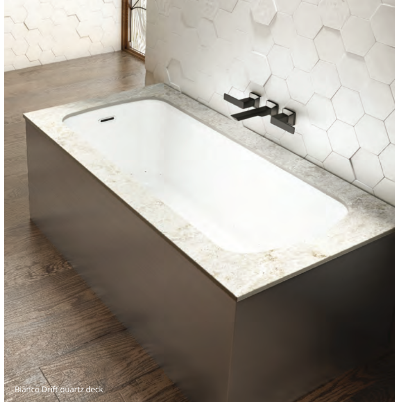
Bianco Drift quartz deck