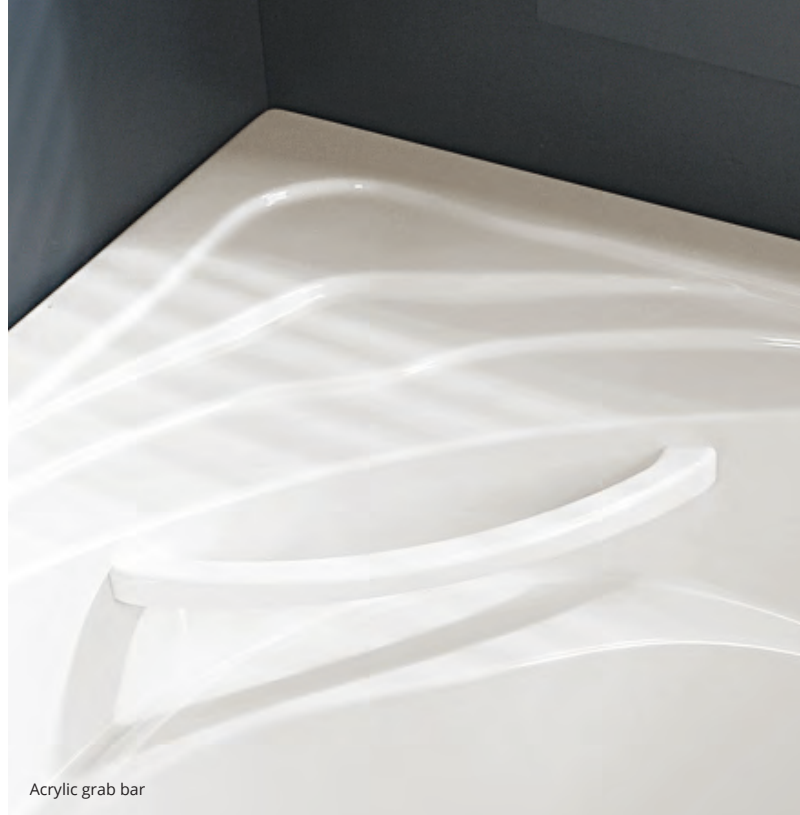
Acrylic grab bar